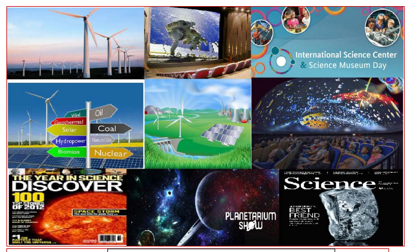
Select any two topics of your choice